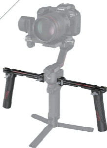
for DJI RS 3