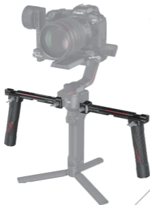
for DJI RS 3 Pro

Designed for DJI RS 2 / RSC 2 / RS 3 / RS 3 Pro / RS 4 / RS 4 Pro / RS 5 gimbal. Comes with cold shoes, 1/4"-20 and ARRI 3/8"-16 accessory mounts. Horizontal Adjustable & Upside Down Holding.